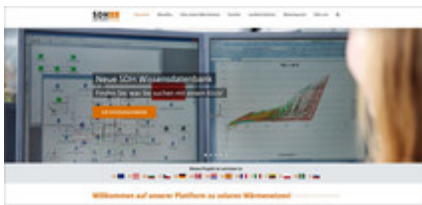
Image shows the homepage of the new solare-waermenetze.de knowledge portal

Large-scale solar thermal systems are being increasingly used in heating networks. The Steinbeis Research Institute Solites in collaboration with international partner organisations has created a newly designed information service on solar-supported heating networks at www.solare-waermenetze.de . At the heart of the web platform is a database that provides comprehensive technical and economic expert knowledge.