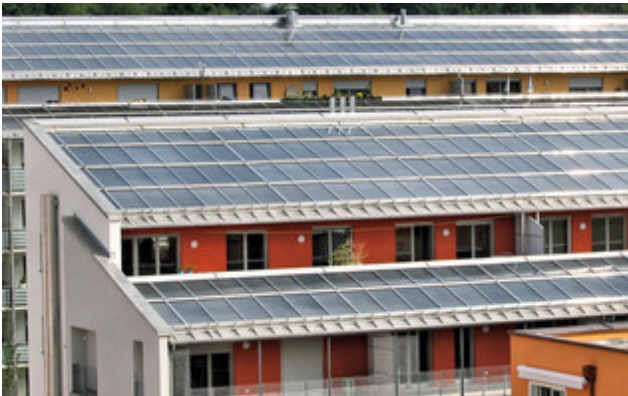
Number of large-scale solar thermal systems in heating networks rising. Photo shows the “Solar local heating district”, the third of four construction phases of the “Ackermannbogen” redevelopment area in Munich.